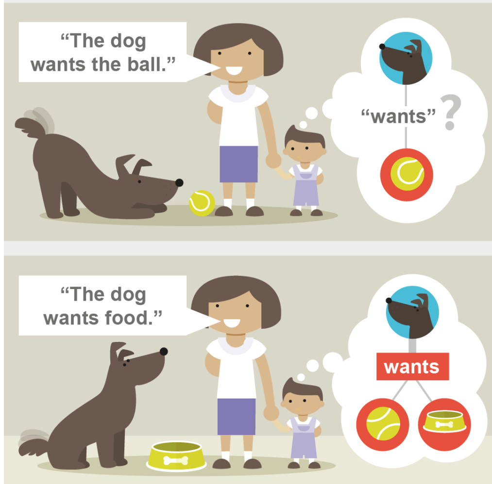
Illustration by Lucy Reading-Ikkanda

word “ball” after the phrase “The dog wants.” Studies show that this theory of building up knowledge of word meaning and grammar approximates the way that two- and three-year-olds actually learn language.